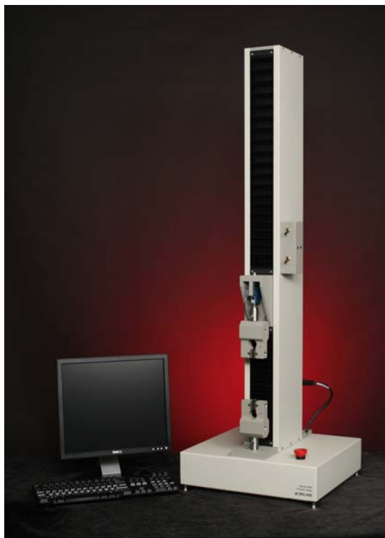
The Model MT-2545 Tensile Tester with Pneumatic Sample Grips and Model MT-2500 Quality Control Software